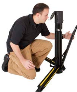
Deploying Nomad PRIME