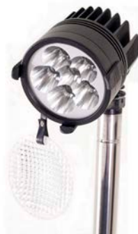
Defuser removed - 8° Spot Light