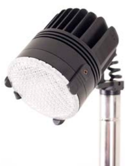
Defuser fitted - 120° Scene Light